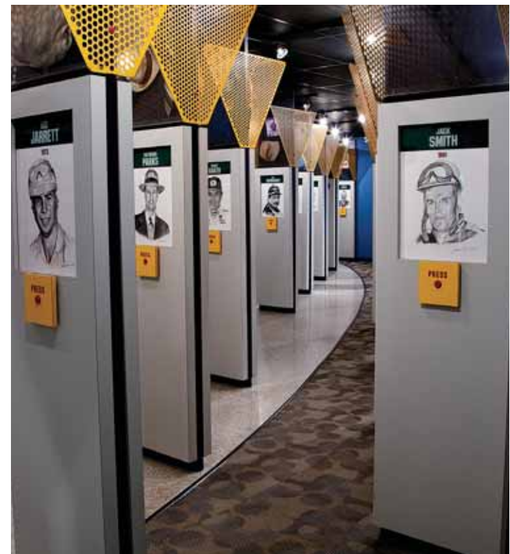
Inside the Darlington Raceway Museum