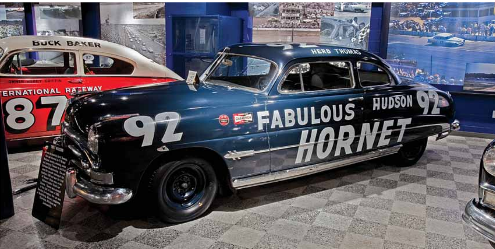
The Fabulous Hudson Hornet on display at the Darlington Raceway Museum